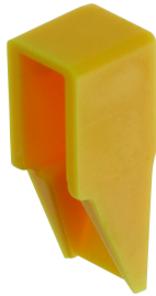
Insulating cap, Colour: Yellow