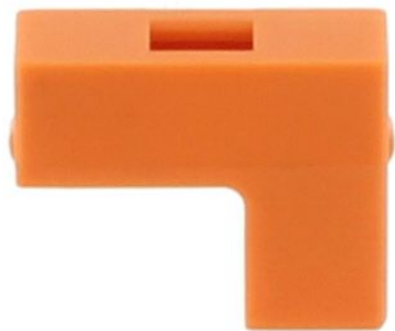
Switch lock, Colour: Orange